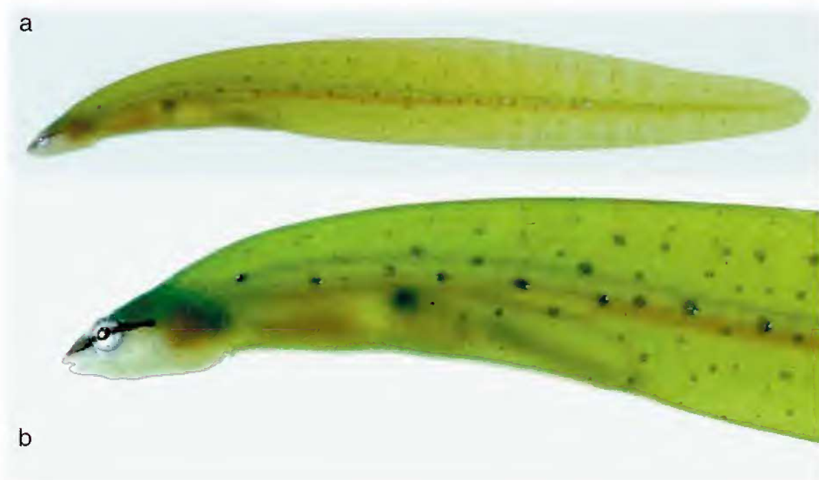
Fig. 3. Alabes gibbosa , paratype, WAM P.32202-001, 71 mm SL, Carnac Island, Western Australia; (a) whole specimen, (b) anterior half of specimen.